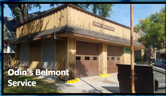
Odin's Belmont Service

216 Belmont Road (3rd Ave. S. door) Lower-level dining room * Freewill-offering spaghetti dinner * Bake sale * Silent auction