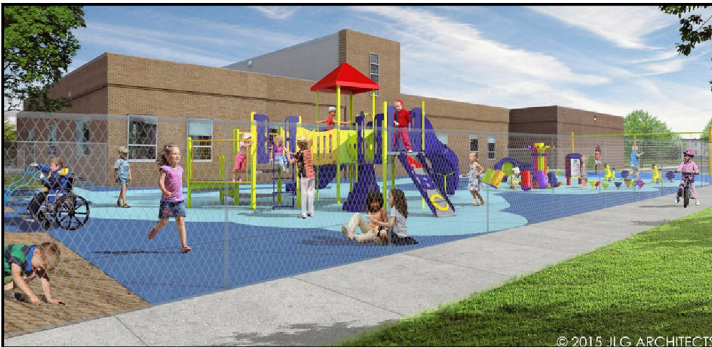
The architect's illustration of the Grand Forks Altru YMCA's playground renovation project includes an image (far left) of a young child in a wheelchair who's trying out a new play station.

The next Faye Gibbens Memorial Grant application process is set to begin in September. Learn more about the grant and how your organization may apply by calling (800) 532-NDAD.